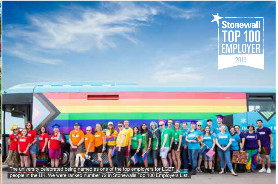
The university celebrated being named as one of the top employers for LGBT people in the UK. We were ranked number 72 in Stonewalls Top 100 Employers List.