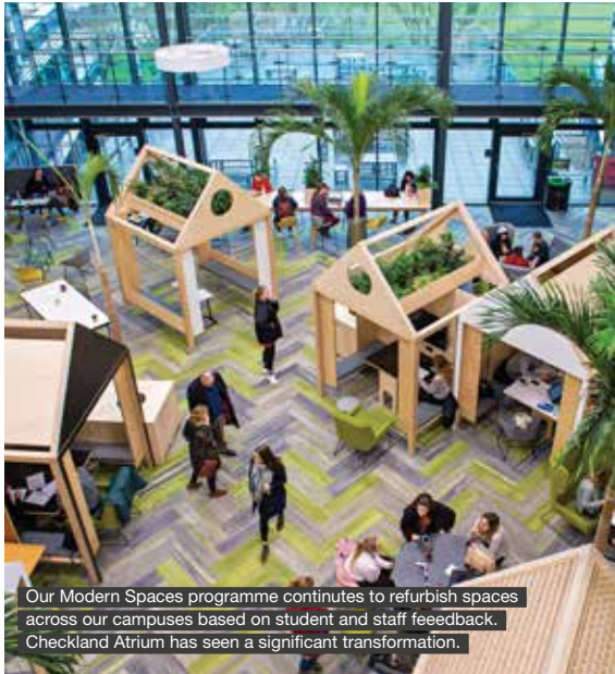
Our Modern Spaces programme continues to refurbish spaces across our campuses based on student and staff feedback. Checkland Atrium has seen a significant transformation.

The university received a Race Equality Charter Bronze Award becoming one of only 13 universities to hold the honour