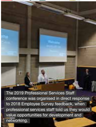
The 2019 Professional Services Staff conference was organised in direct response to 2018 Employee Survey feedback, when professional services staff told us they would value opportunities for development and networking.