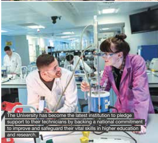
The University has become the latest institution to pledge support to their technicians by backing a national commitment to improve and safeguard their vital skills in higher education and research.